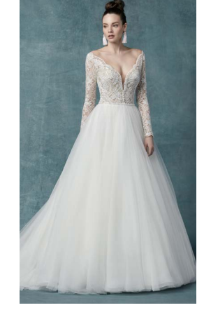
Mallory Dawn 9MS114