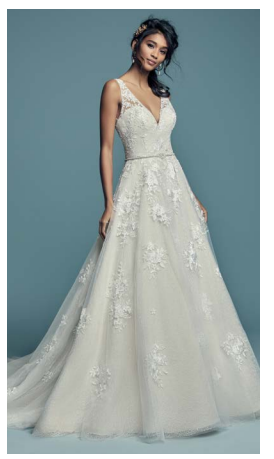
Meryl Lynette 7MS339MC