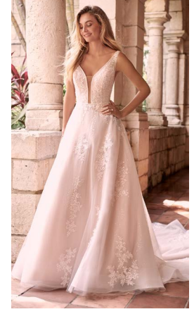
Leticia Lynette 21MK394AC